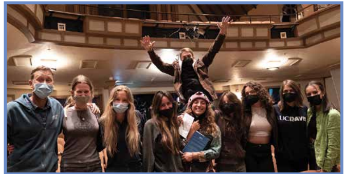
Carmel High School teacher and students at The Futurist Edition