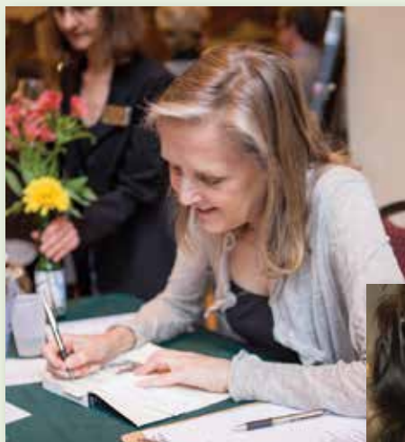
Annual fundraiser at the Sunset Center featuring bestselling author Mary Roach in conversation with Science Friday's Ira Flatow was a full house success for the library.

Thank you for making our Pop-Sci Fundraiser an overwhelming success!