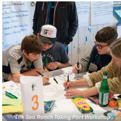
The Sea Ranch Taking Part Workshop