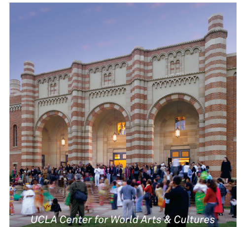
UCLA Center for World Arts & Cultures