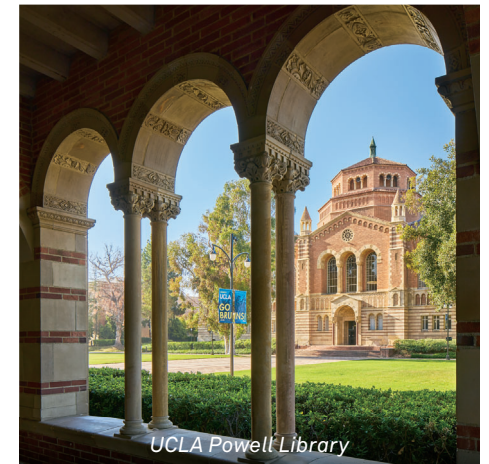
UCLA Powell Library