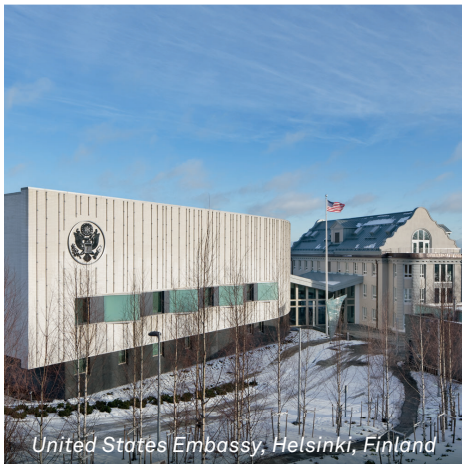
United States Embassy, Helsinki, Finland

AIA National Firm of the Year AIA California Firm of the Year AIA Los Angeles Gold Medal American Library Association Library Building Award California Governor's Historic Preservation Award California Preservation Foundation Design Award Los Angeles Conservancy Preservation Award