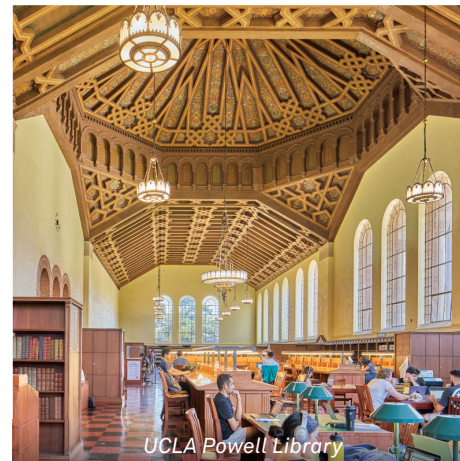
UCLA Powell Library