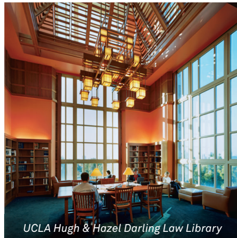
UCLA Hugh & Hazel Darling Law Library